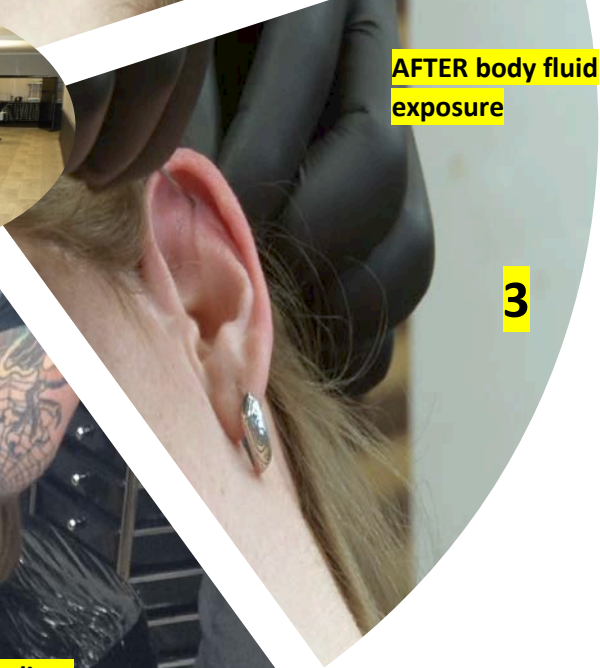
AFTER body fluid exposure