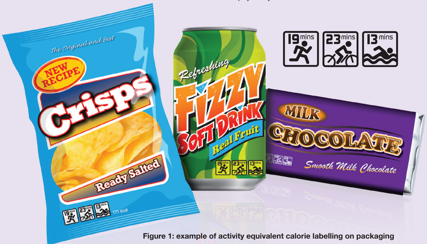
Figure 1: example of activity equivalent calorie labelling on packaging

Ultimately, the objective of activity equivalent calorie labelling is to encourage people to be more mindful of the calories they consume, how these calories relate to people’s everyday lives and to encourage them to be more physically active.